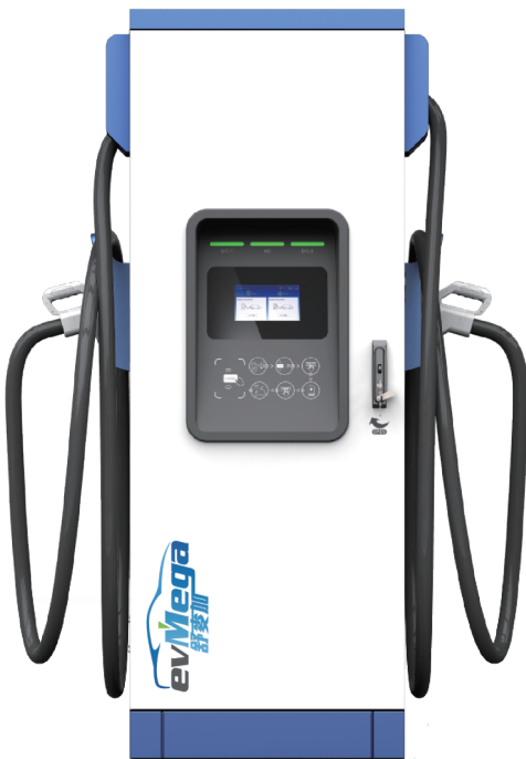
DC | DC 150kW Charger Floor Standing