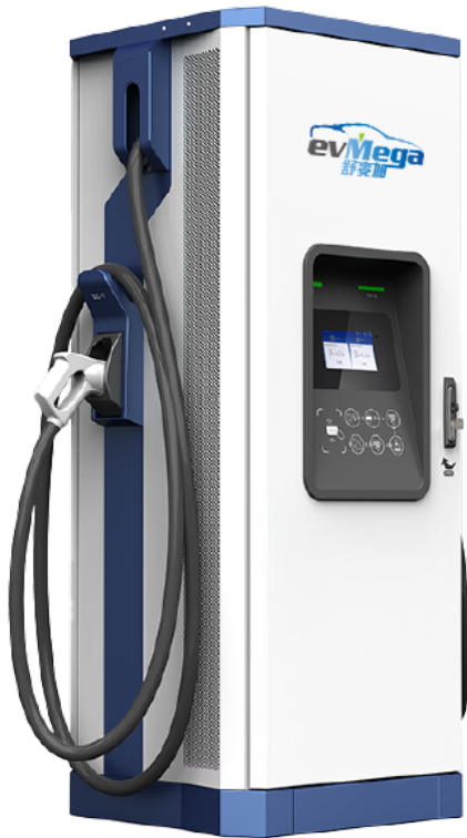
DC | DC 240kW Charger Floor Standing